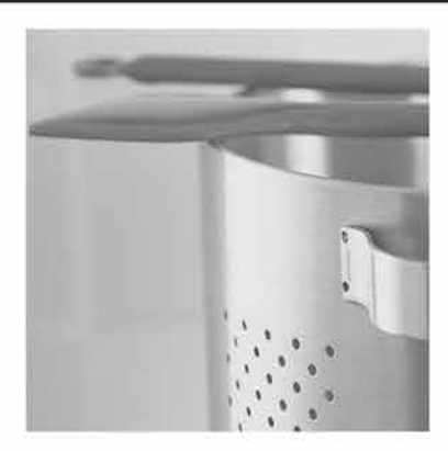
Návod k použití Návod na použitie Instrucţiuni de utilizare Инструкции по эксплуатации