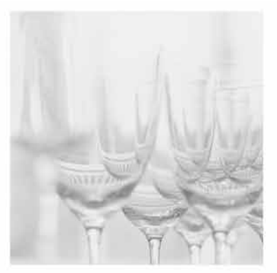
Οδηγίες χρήσης Instrukcje użytkowania Használati utasítás Инструкция за употреба